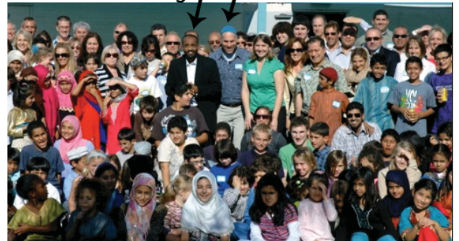
Families from both congregations